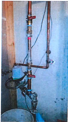
Examples of acceptable meter setting configurations.

----- Call the BGUA with meter piping questions and to schedule a meter installation; giving at least 24 hours notice.